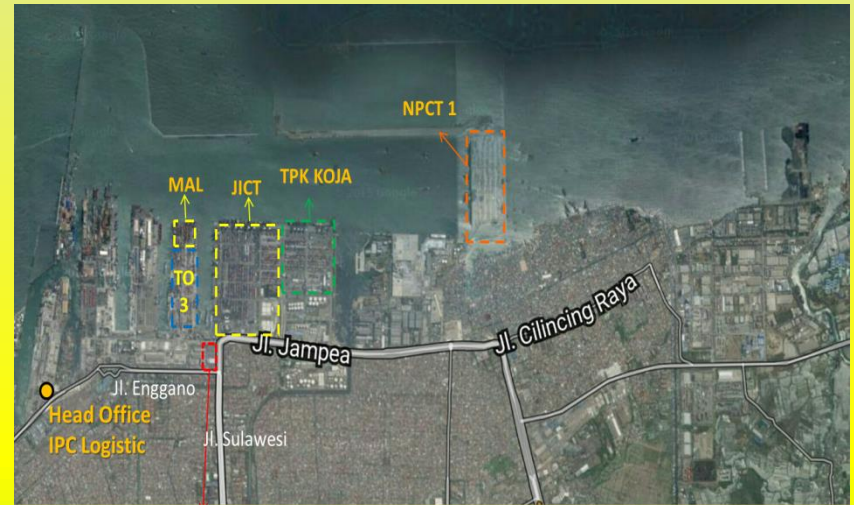
HALAL LOGISTIC & COLD STORAGE

It is near the major container terminals in Port of Tanjung Priok, namely Jakarta International Container Terminal (JICT), Terminal 3 (TO 3), Terminal PT Mustika Alam Lestari (PT MAL), TPK Koja & New Priok Container Terminal 1 (NPCT 1)